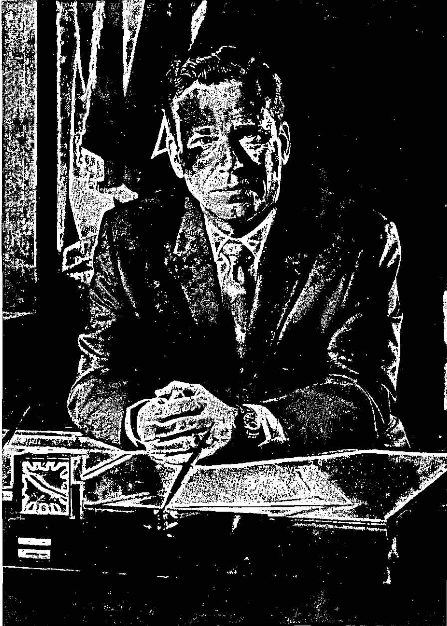
WARREN E. HEARNES